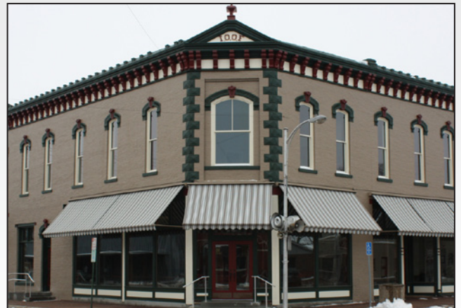
Woodbine historic Odd Fellows building offering mixed-use

Solution: A detailed business plan was developed that included a schedule and creative financing package.