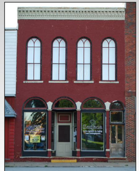
Bloomfield housing and business project

Solution: Handholding and technical assistance through the grant administrators at the regional Council of Governments and the local Main Street program were vital to the owner's success.