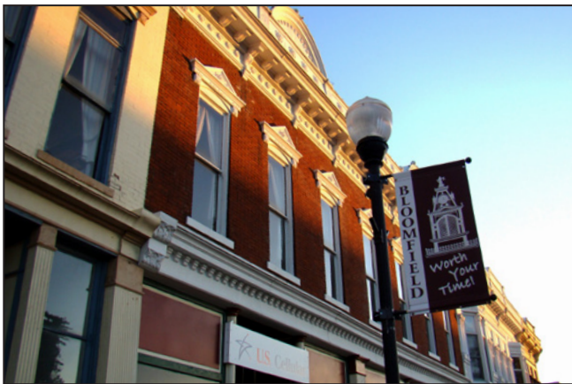
Upper story housing is part of the rehabilitation efforts in Bloomfield