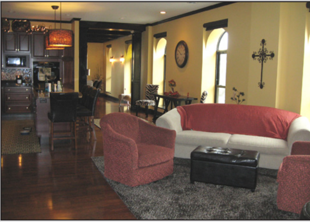
Burlington condominium living spaces (above and below)