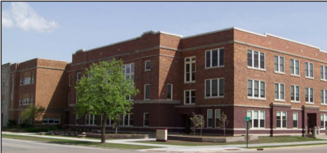
Spencer historic school building with 16 units of affordable housing

Solution: The Friends of the Auditorium group spent over a year advocating for rehabilitation of the building and involving the community, which led them to Community Housing Initiatives (CHI). CHI had the capacity to take on the project, including 16 affordable apartments. CHI also had the creativity and expertise to split ownership and maintenance responsibilities of the different floors amidst several organizations.